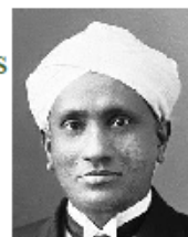
Prof. C. V. Raman

NATIONAL SCIENCE DAY (28 th February 2023)